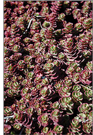
Red Carpet Stonecrop foliage

This plant will require occasional maintenance and upkeep, and is best cleaned up in early spring before it resumes active growth for the season. Deer don't particularly care for this plant and will usually leave it alone in favor of tastier treats. Gardeners should be aware of the following characteristic(s) that may warrant special consideration;