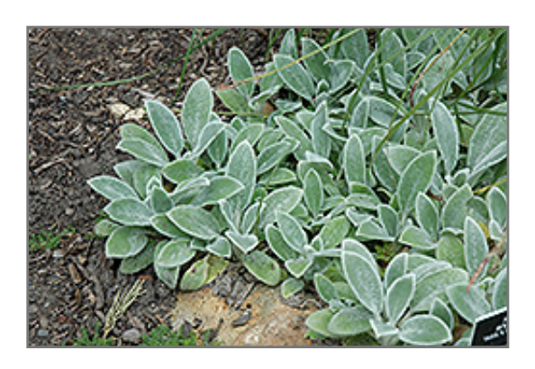
Silver Carpet Lamb's Ears