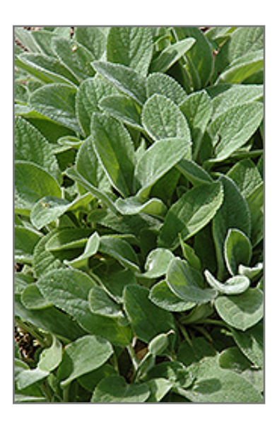
Silver Carpet Lamb's Ears foliage

Silver Carpet Lamb's Ears is recommended for the following landscape applications;