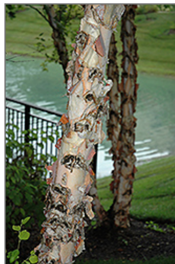
River Birch bark