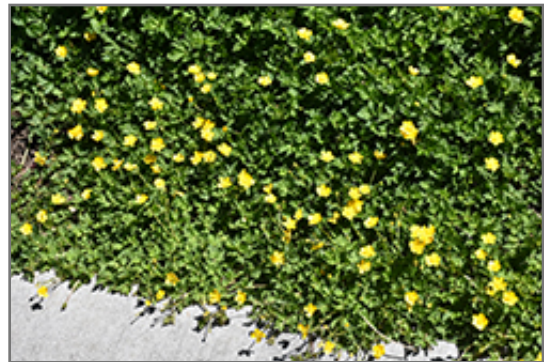
Barren Strawberry in bloom