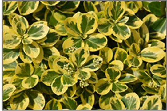
Gold Splash Wintercreeper flower buds

This shrub performs well in both full sun and full shade. It is very adaptable to both dry and moist locations, and should do just fine under typical garden conditions. It is not particular as to soil type or pH. It is highly tolerant of urban pollution and will even thrive in inner city environments, and will benefit from being planted in a relatively sheltered location. This is a selected variety of a species not originally from North America.