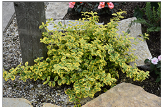
Gold Splash Wintercreeper