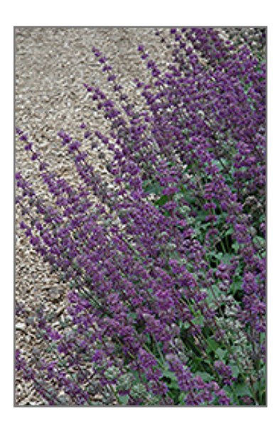
Purple Rain Salvia in bloom

An erect perennial variety featuring arched, whorled spikes of two-lipped violet-purple flowers throughout summer; tolerates drought once established; best in poorer soils; deadhead to extend flowering; perfect for borders, rock gardens, or naturalizing