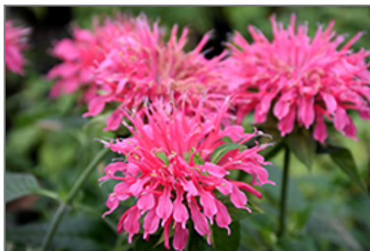
Coral Reef Beebalm flowers

Coral Reef Beebalm is recommended for the following landscape applications;