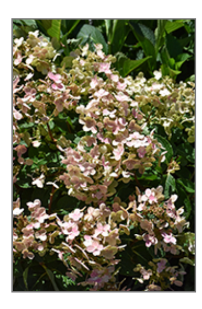
Early Evolution Hydrangea flowers