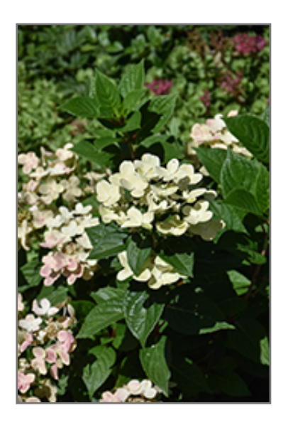
Early Evolution Hydrangea flowers