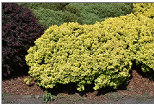
Golden Nugget Japanese Barberry