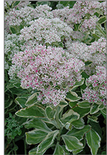
Frosty Morn Stonecrop flowers