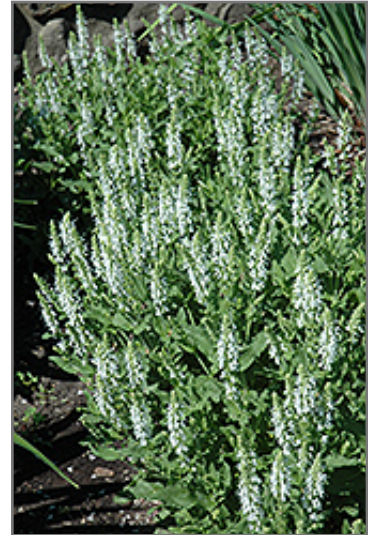
Snow Hill Sage in bloom

Snow Hill Sage is a fine choice for the garden, but it is also a good selection for planting in outdoor pots and containers. It is often used as a 'filler' in the 'spiller-thriller-filler' container combination, providing a mass of flowers against which the larger thriller plants stand out. Note that when growing plants in outdoor containers and baskets, they may require more frequent waterings than they would in the yard or garden.