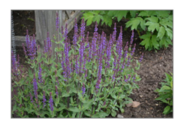
Caradonna Sage in bloom

This is a relatively low maintenance plant, and is best cleaned up in early spring before it resumes active growth for the season. It is a good choice for attracting butterflies and hummingbirds to your yard, but is not particularly attractive to deer who tend to leave it alone in favor of tastier treats. It has no significant negative characteristics.