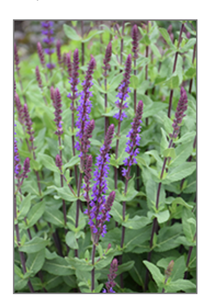
Caradonna Sage flowers