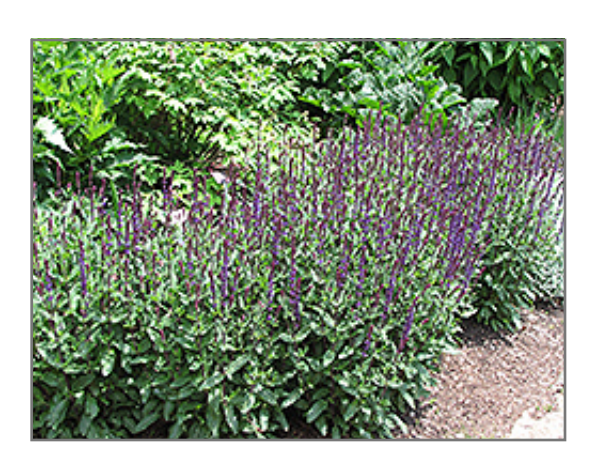
Caradonna Sage in bloom

Caradonna Sage will grow to be about 24 inches tall at maturity, with a spread of 24 inches. When grown in masses or used as a bedding plant, individual plants should be spaced approximately 18 inches apart. It grows at a medium rate, and under ideal conditions can be expected to live for approximately 5 years. As an herbaceous perennial, this plant will usually die back to the crown each winter, and will regrow from the base each spring. Be careful not to disturb the crown in late winter when it may not be readily seen!