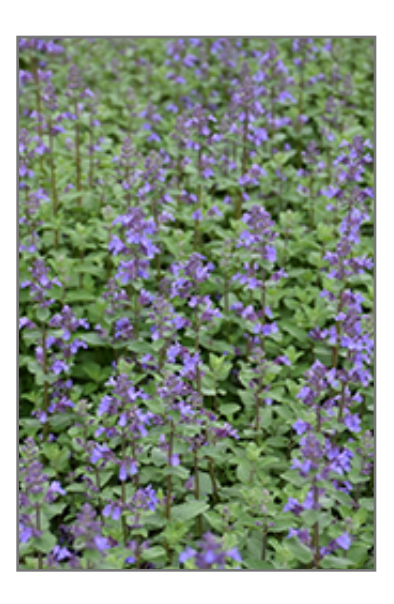
Blue Wonder Catmint flowers

Blue Wonder Catmint has masses of beautiful spikes of lightly-scented royal blue flowers with powder blue overtones rising above the foliage from late spring to early fall, which are most effective when planted in groupings. Its small fragrant pointy leaves remain grayish green in color throughout the season.