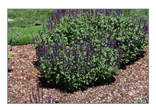
Caramia Meadow Sage in bloom