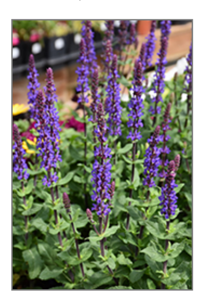
Caramia Meadow Sage flowers