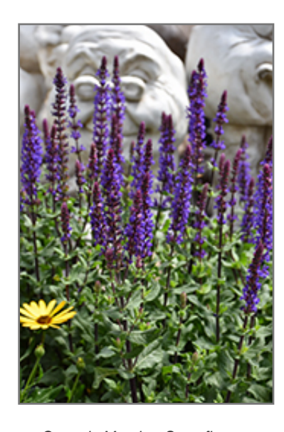
Caramia Meadow Sage flowers

Caramia Meadow Sage is an herbaceous perennial with an upright spreading habit of growth. Its relatively fine texture sets it apart from other garden plants with less refined foliage.