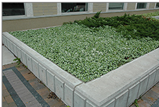
White Nancy Spotted Dead Nettle in bloom