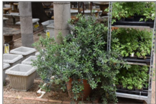
Little Ollie&reg Dwarf Olive