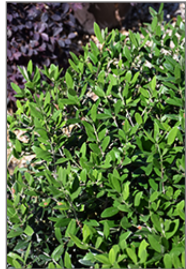
Little Ollie&reg Dwarf Olive foliage

Little Ollie&reg Dwarf Olive makes a fine choice for the outdoor landscape, but it is also well-suited for use in outdoor pots and containers. With its upright habit of growth, it is best suited for use as a 'thriller' in the 'spiller-thriller-filler' container combination; plant it near the center of the pot, surrounded by smaller plants and those that spill over the edges. It is even sizeable enough that it can be grown alone in a suitable container. Note that when grown in a container, it may not perform exactly as indicated on the tag - this is to be expected. Also note that when growing plants in outdoor containers and baskets, they may require more frequent waterings than they would in the yard or garden. Be aware that in our climate, this plant may be too tender to survive the winter if left outdoors in a container. Contact our experts for more information on how to protect it over the winter months.