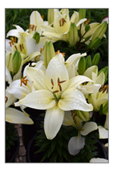
Lily Looks Tiny Crystal Lily flowers

This variety is a compact lily that bears well formed, upward facing, crystal clear white blooms with a hint of green; perfect for containers or massing along borders; they are also known to have multiple blooms per stem