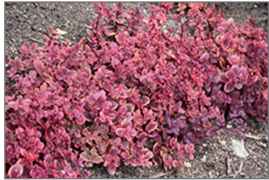
Sunsparkler Wildfire Stonecrop