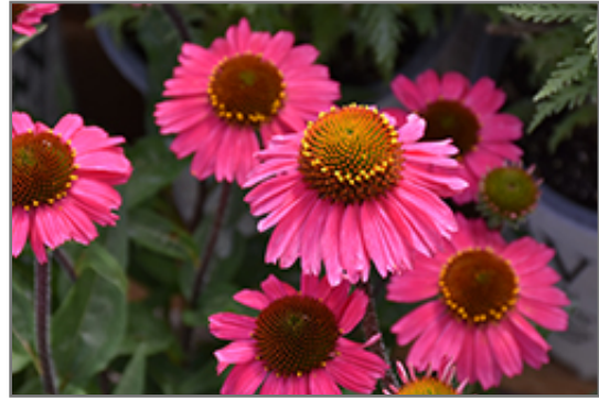
Sensation Pink Coneflower flowers

Sensation Pink Coneflower is recommended for the following landscape applications;