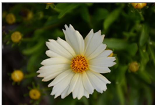
UpTick Cream Tickseed flowers