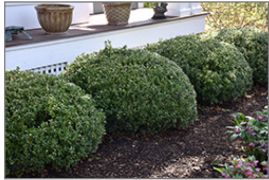
Sprinter Boxwood

Sprinter Boxwood will grow to be about 4 feet tall at maturity, with a spread of 4 feet. It tends to fill out right to the ground and therefore doesn't necessarily require facer plants in front. It grows at a fast rate, and under ideal conditions can be expected to live for approximately 30 years.