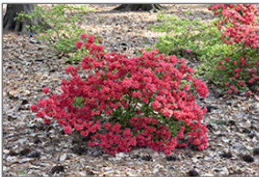
Girard's Crimson Azalea in bloom