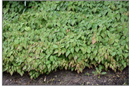
Bishop's Hat