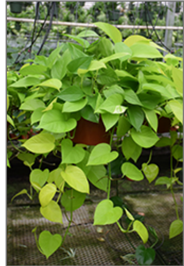
Neon Pothos in full

When grown indoors, Neon Pothos can be expected to grow to be about 5 feet tall at maturity, with a spread of 24 inches. It grows at a fast rate, and under ideal conditions can be expected to live for approximately 10 years. This houseplant performs well in both bright or indirect sunlight and strong artificial light, and can therefore be situated in almost any well-lit room or location. It does best in average to evenly moist soil, but will not tolerate standing water. The surface of the soil shouldn't be allowed to dry out completely, and so you should expect to water this plant once and possibly even twice each week. Be aware that your particular watering schedule may vary depending on its location in the room, the pot size, plant size and other conditions; if in doubt, ask one of our experts in the store for advice. It is not particular as to soil type or pH; an average potting soil should work just fine. Be warned that parts of this plant are known to be toxic to humans and animals, so special care should be exercised if growing it around children and pets.