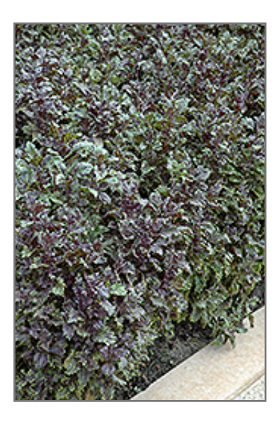
Red Frills Basil