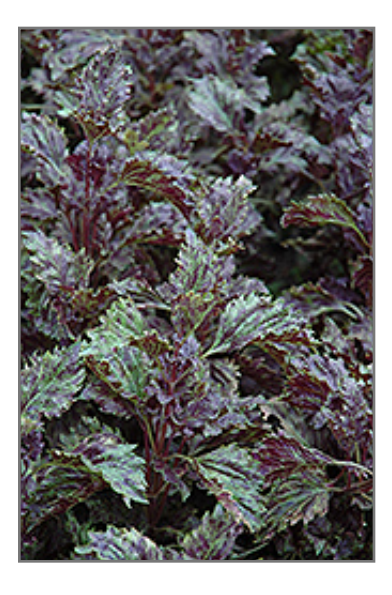
Red Frills Basil foliage

Red Frills Basil will grow to be about 24 inches tall at maturity, with a spread of 24 inches. When grown in masses or used as a bedding plant, individual plants should be spaced approximately 18 inches apart. This fast-growing annual will normally live for one full growing season, needing replacement the following year.