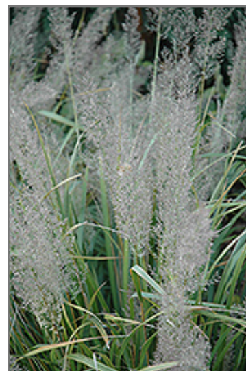
Korean Reed Grass fruit