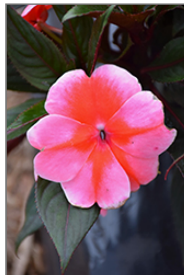
Florific Sweet Orange New Guinea Impatiens flowers

Florific Sweet Orange New Guinea Impatiens is recommended for the following landscape applications;