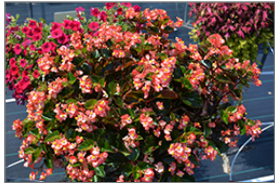
BabyWing Bicolor Begonia in bloom