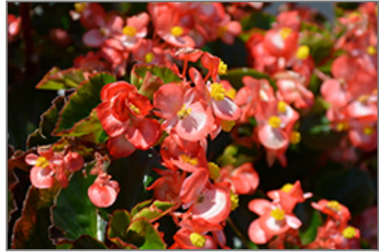
BabyWing Bicolor Begonia flowers

This is a high maintenance plant that will require regular care and upkeep, and usually looks its best without pruning, although it will tolerate pruning. Deer don't particularly care for this plant and will usually leave it alone in favor of tastier treats. Gardeners should be aware of the following characteristic(s) that may warrant special consideration;