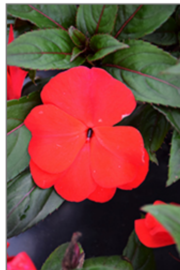
Divine Scarlet Bronze Leaf New Guinea Impatiens flowers

Divine Scarlet Bronze Leaf New Guinea Impatiens is recommended for the following landscape applications;