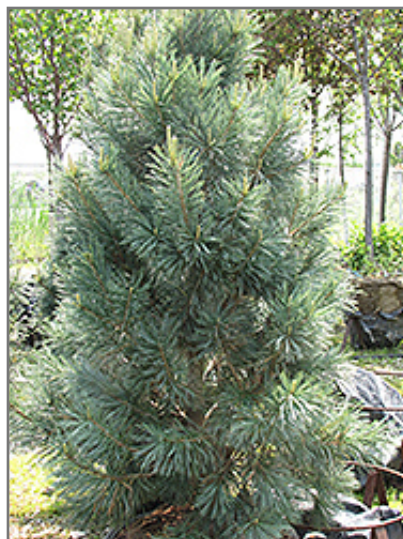
Vanderwolf's Pyramid Pine