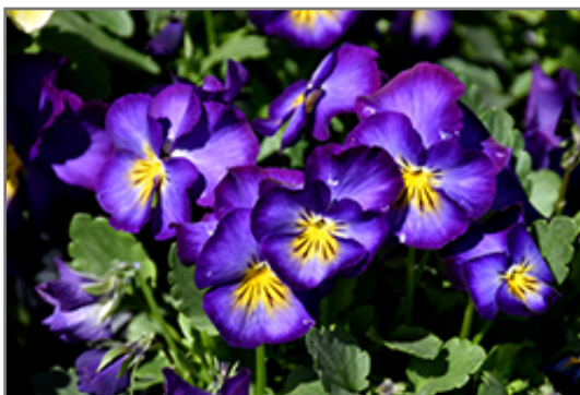
Halo Violet Pansy flowers