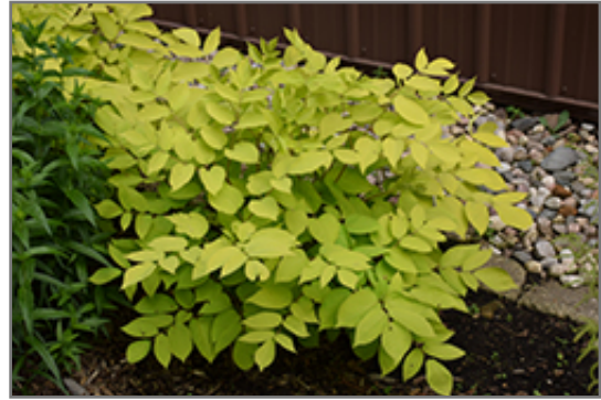
Sun King Japanese Spikenard