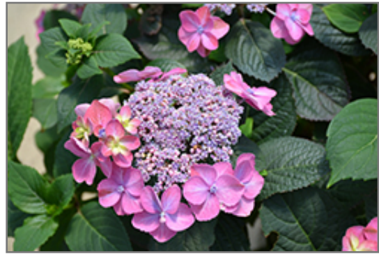
Tuff Stuff Hydrangea flowers

Tuff Stuff Hydrangea makes a fine choice for the outdoor landscape, but it is also well-suited for use in outdoor pots and containers. With its upright habit of growth, it is best suited for use as a 'thriller' in the 'spiller-thriller-filler' container combination; plant it near the center of the pot, surrounded by smaller plants and those that spill over the edges. It is even sizeable enough that it can be grown alone in a suitable container. Note that when grown in a container, it may not perform exactly as indicated on the tag - this is to be expected. Also note that when growing plants in outdoor containers and baskets, they may require more frequent waterings than they would in the yard or garden.