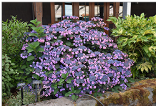
Tuff Stuff Hydrangea in bloom