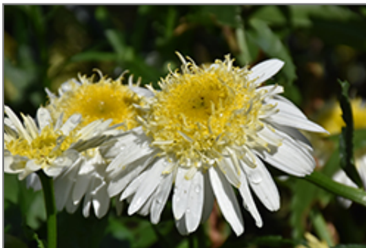
Realflor Real Glory Shasta Daisy flowers

Realflor Real Glory Shasta Daisy is recommended for the following landscape applications;