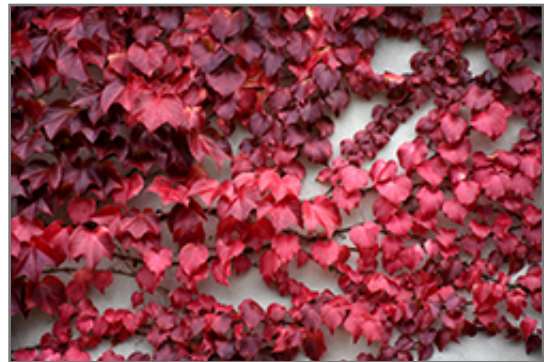
Veitch Boston Ivy in fall