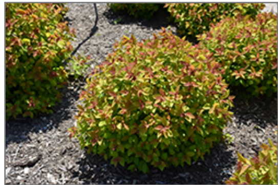
Double Play Big Bang Spirea