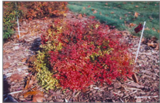
Dakota Goldcharm Spirea in fall

This shrub should only be grown in full sunlight. It prefers to grow in average to moist conditions, and shouldn't be allowed to dry out. It is not particular as to soil type or pH. It is highly tolerant of urban pollution and will even thrive in inner city environments. This is a selected variety of a species not originally from North America.