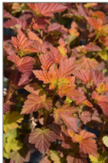
Amber Jubilee Ninebark foliage

This shrub will require occasional maintenance and upkeep, and can be pruned at anytime. It has no significant negative characteristics.