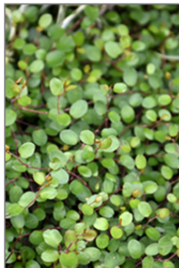
Creeping Wire Vine foliage