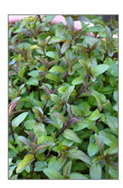
Chocolate Mint foliage

This is an herbaceous perennial herb with a spreading, ground-hugging habit of growth. Its medium texture blends into the garden, but can always be balanced by a couple of finer or coarser plants for an effective composition. This is a high maintenance plant that will require regular care and upkeep, and should be cut back in late fall in preparation for winter. It is a good choice for attracting bees and butterflies to your yard, but is not particularly attractive to deer who tend to leave it alone in favor of tastier treats. Gardeners should be aware of the following characteristic(s) that may warrant special consideration;