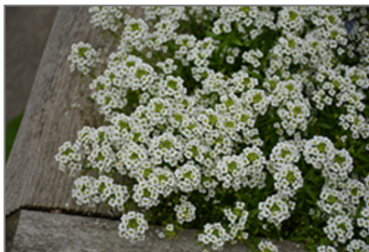
Snow Princess Alyssum flowers

Snow Princess Alyssum is recommended for the following landscape applications;