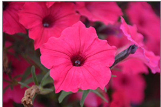
Supertunia Vista Fuchsia Petunia flowers