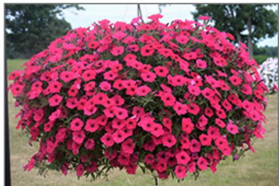
Supertunia Vista Fuchsia Petunia in bloom