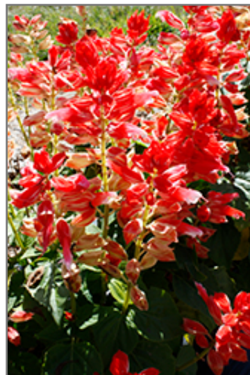
Vista Red And White Salvia flowers