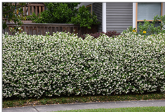
Confederate Star-Jasmine in bloom