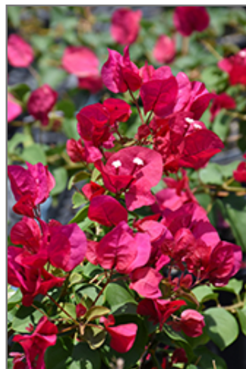
Barbara Karst Bougainvillea flowers