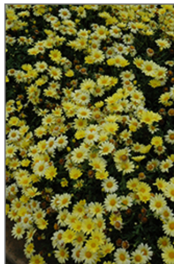
Butterfly Marguerite Daisy flowers