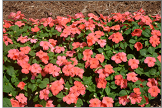
Super Elfin XP Melon Impatiens flowers

Super Elfin XP Melon Impatiens will grow to be about 10 inches tall at maturity, with a spread of 12 inches. When grown in masses or used as a bedding plant, individual plants should be spaced approximately 10 inches apart. Its foliage tends to remain low and dense right to the ground. This fast-growing annual will normally live for one full growing season, needing replacement the following year.