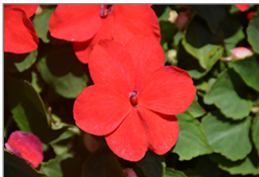
Super Elfin XP Melon Impatiens in bloom

Super Elfin XP Melon Impatiens is recommended for the following landscape applications;