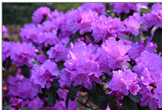
P.J.M. Elite Rhododendron flowers

P.J.M. Elite Rhododendron is recommended for the following landscape applications;