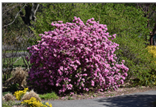
P.J.M. Elite Rhododendron in bloom