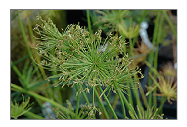
Sharp Edge Sedge foliage