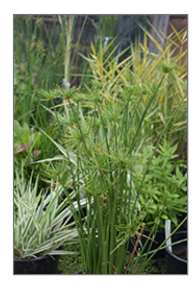
Sharp Edge Sedge