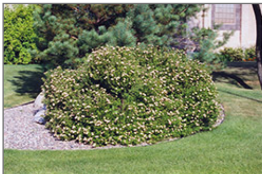
Pink Beauty Potentilla in bloom